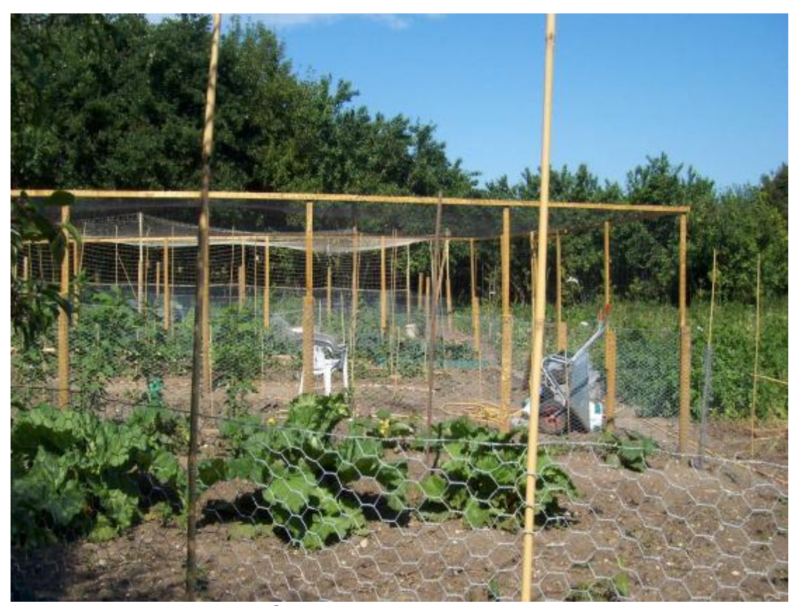
Vicarage Lane Allotment, Site AT3

Vicarage Lane would highlight the presence of the site to outsiders and increase the risk of people trespassing onto the site.