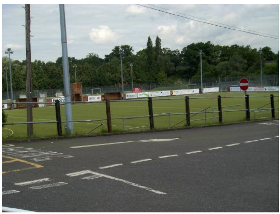
Old Loughtonians Hockey Club, Site FP3