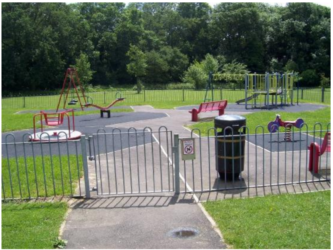
Chigwell Row Recreation Ground Playground (CY3)

need of removal or replacement. No seating is provided, and the two bins present are very worn. Evidence of litter and graffiti can be seen all over the playground, detracting further from its overall visual amenity, which is already relatively poor.