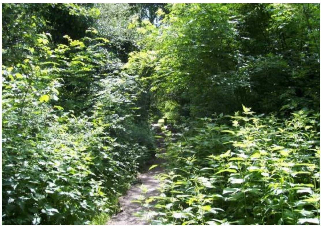
Chigwell Row Wood, Site SO1