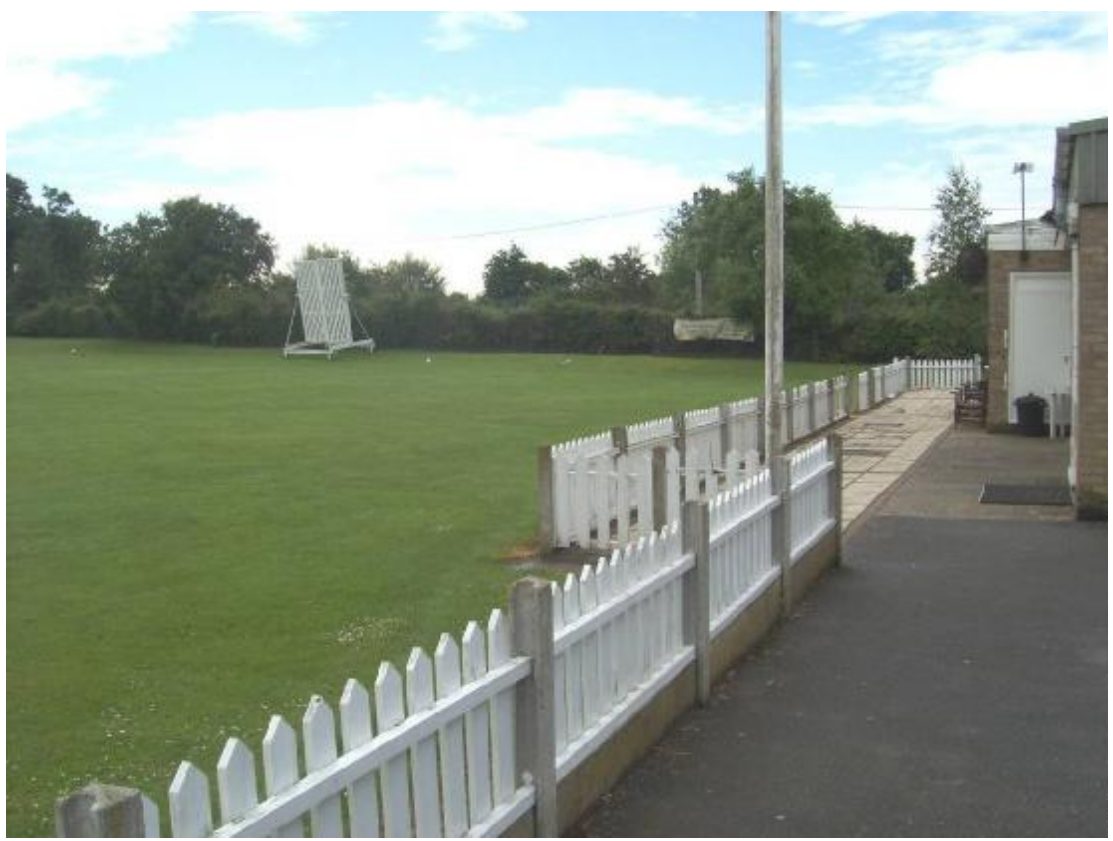
Fives and Heronians Cricket Club, Site FP2

reasonably high amounts of litter and dog excrement which are present. This issue is exacerbated further by the fact that all of the bins along the site's border with Copperfield have been badly vandalised and are in need of replacement.