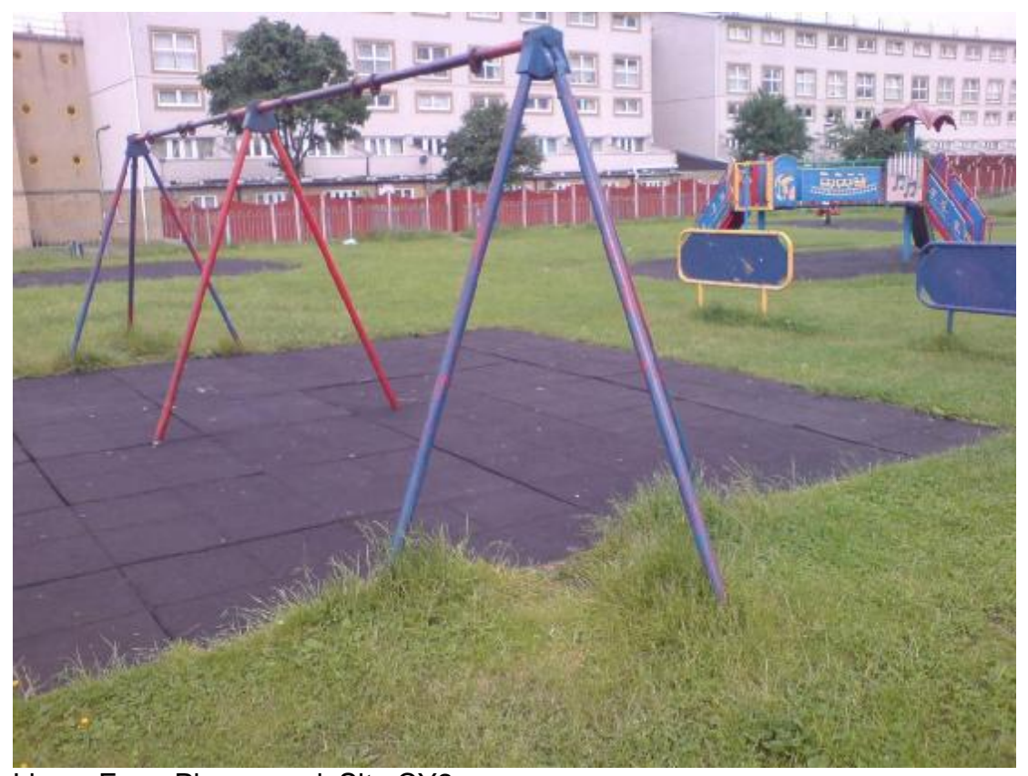
Limes Farm Playground, Site CY2

7.1 There is one well-placed information sign at the entrance, which is in good condition, and adequate seating and litter bins are provided. One potential issue with the playground regards it accessibility. There are no hard standing pathways leading up to it, and whilst the surfaces around the children's facilities are covered with rubber, the rest of the playground is covered with grass, which is inconvenient for pushchair and wheelchair users to traverse, particularly during colder and wetter times of year.