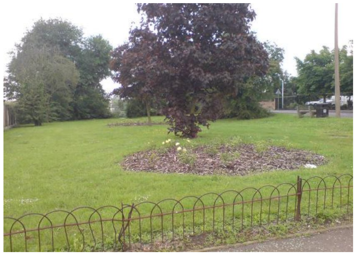
Land south of the junction between Manor Road and Millwall Crescent, Site MO10