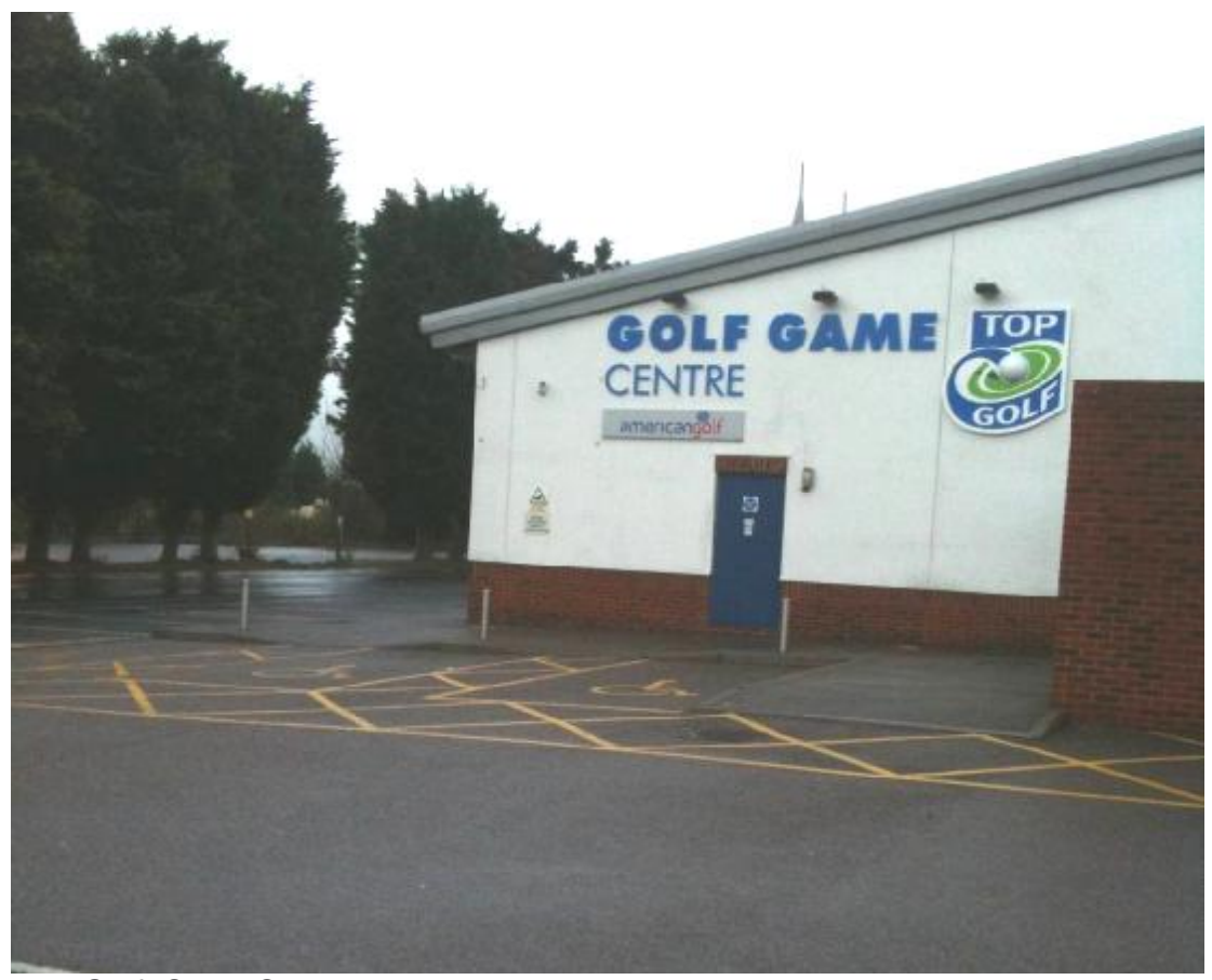
Top Golf, Site AS6

5.5 Located adjacent to the north east of Woolston Manor Golf Course (AS2) along Abridge Road, this site is home to Topgolf Chigwell a golf driving range which features computerized microchipped golf balls that track shot accuracy and distance whilst awarding points by hitting targets from 20-250 yards away. Offering 55 covered bays as well as a variety of indoor catering and socialising facilities this site is frequently used by locals and visitors alike.