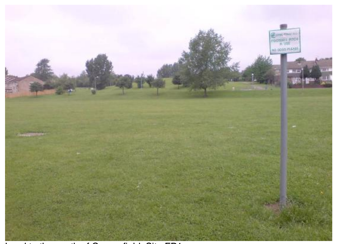
Land to the south of Copperfield, Site FP1