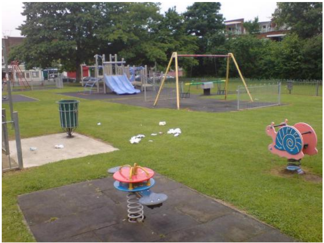
Chigwell Station Green Playground, Site CY1