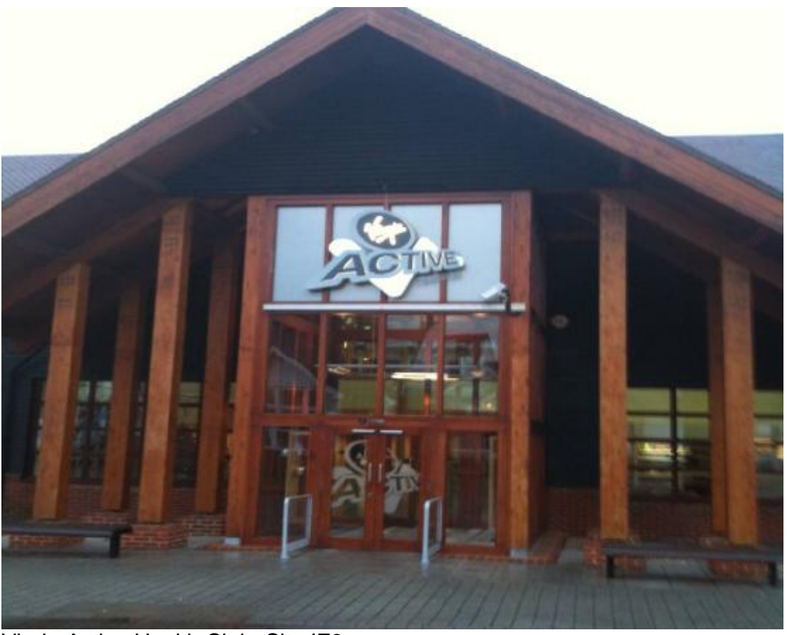
Virgin Active Health Club, Site IF2

8.0 This site is located to the south of Roding Valley Nature Reserve, and can be accessed via a turn off heading northwards from Roding Lane, close to the parish border with Buckhurst Hill. The club provides 17 indoor and outdoor tennis courts, as well as wide range of indoor facilities including two swimming pools, gym and spa, children's area, crèche and nursery. Use of these facilities however requires membership.