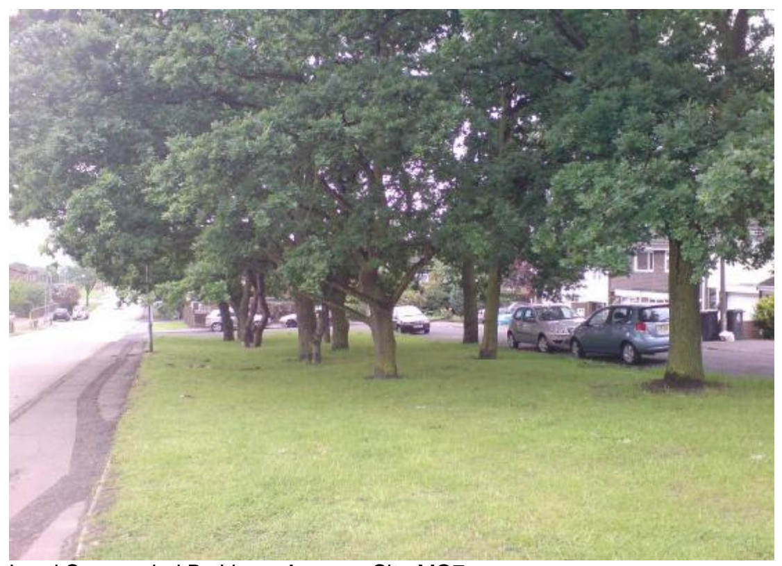
Land Surrounded By Limes Avenue, Site MO7

10.8 Located opposite the junction between Limes Avenue and Regency Close, this site is entirely surrounded by Limes Avenue and its lay-by. It is largely grass land, with twelve large trees evenly dispersed throughout. It is a smart site which is clearly very well kept. However, the grassy edges around its perimeter are being degraded by vehicles being parked there.