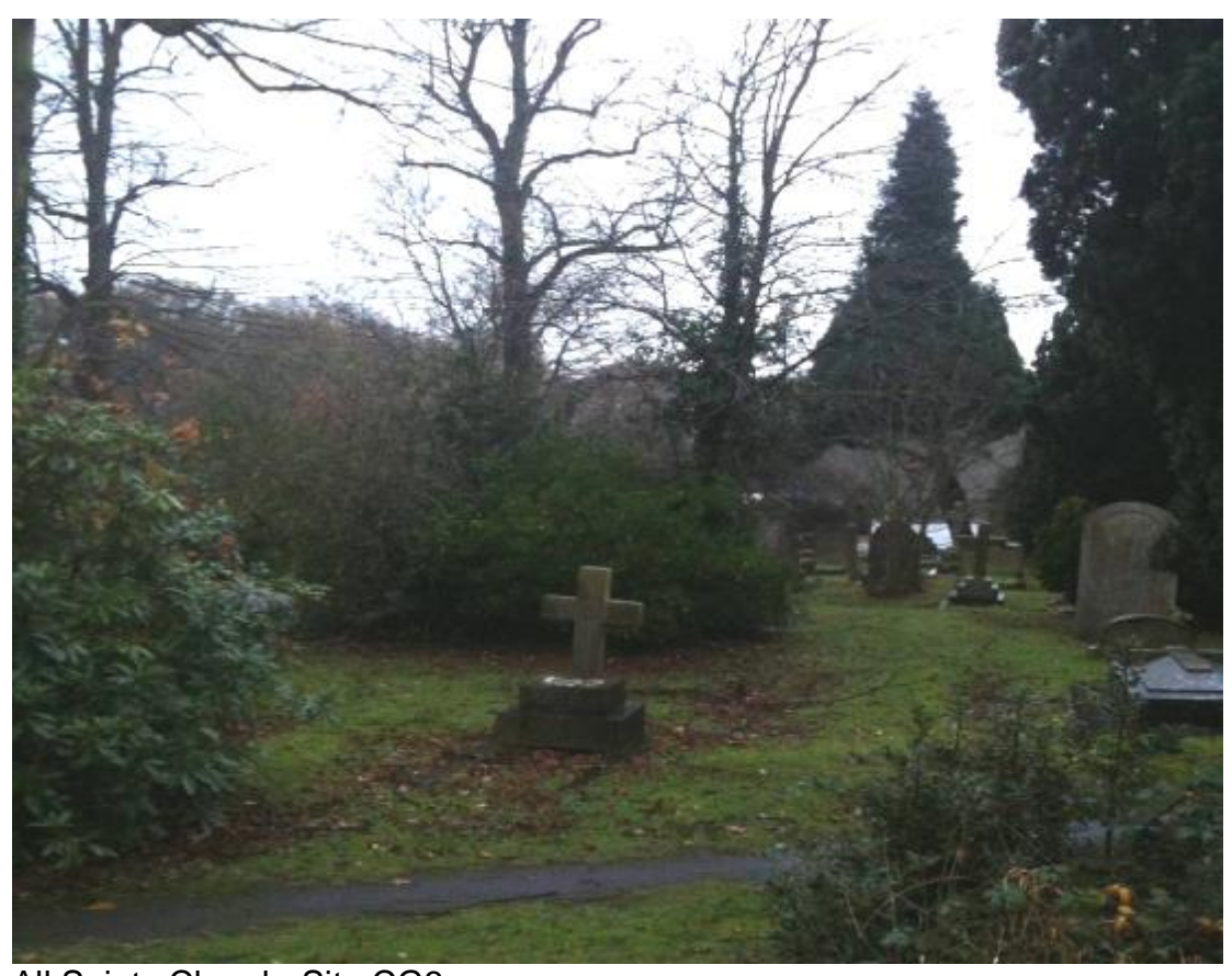
All Saints Church, Site CG3