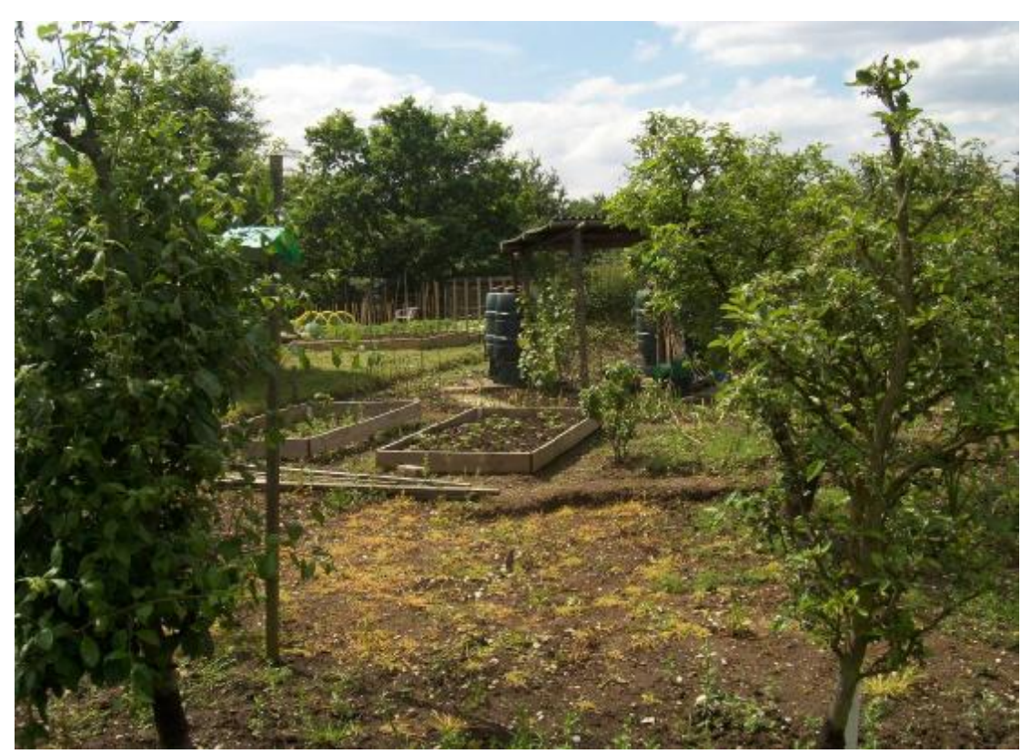
Gravel Lane Allotment, Site AT2

2.4 The allotment itself appears to be in an adequate condition, and is reasonably pleasant in appearance with the sites wild flower area in particular adding to the overall amenity value of the site. The small shed to the north appears to be in use, but seems rather run down, whilst around half of the site appears to be untended and will be addressed by the Parish Council's Allotment Audit. One issue the Parish Council is addressing is the horticultural and other waste. This includes broken glass, which forms a potential safety hazard.