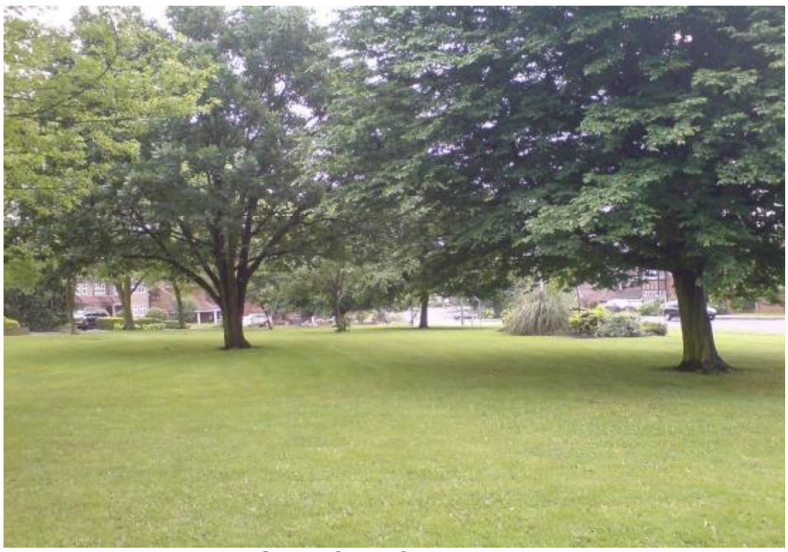
Land surrounded by Lee Grove, Site MO3

trees and a number of planted areas spread all over, adding significantly to its visual amenity. Two metal benches can be found to the south, facing Chigwell Rise, although no bins have been provided with them. Overall, the site is clean, tidy, smart in appearance, and evidently very well looked after.