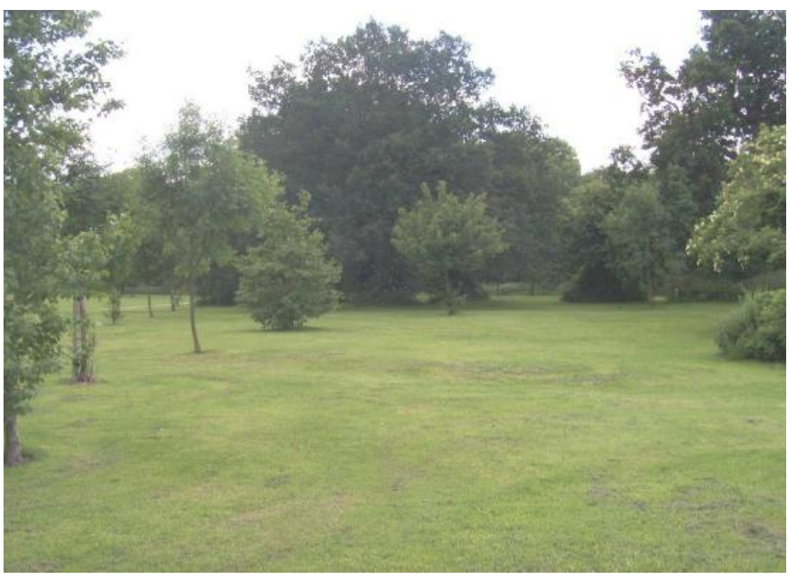
Chigwell Row Recreation Ground, Site FP5