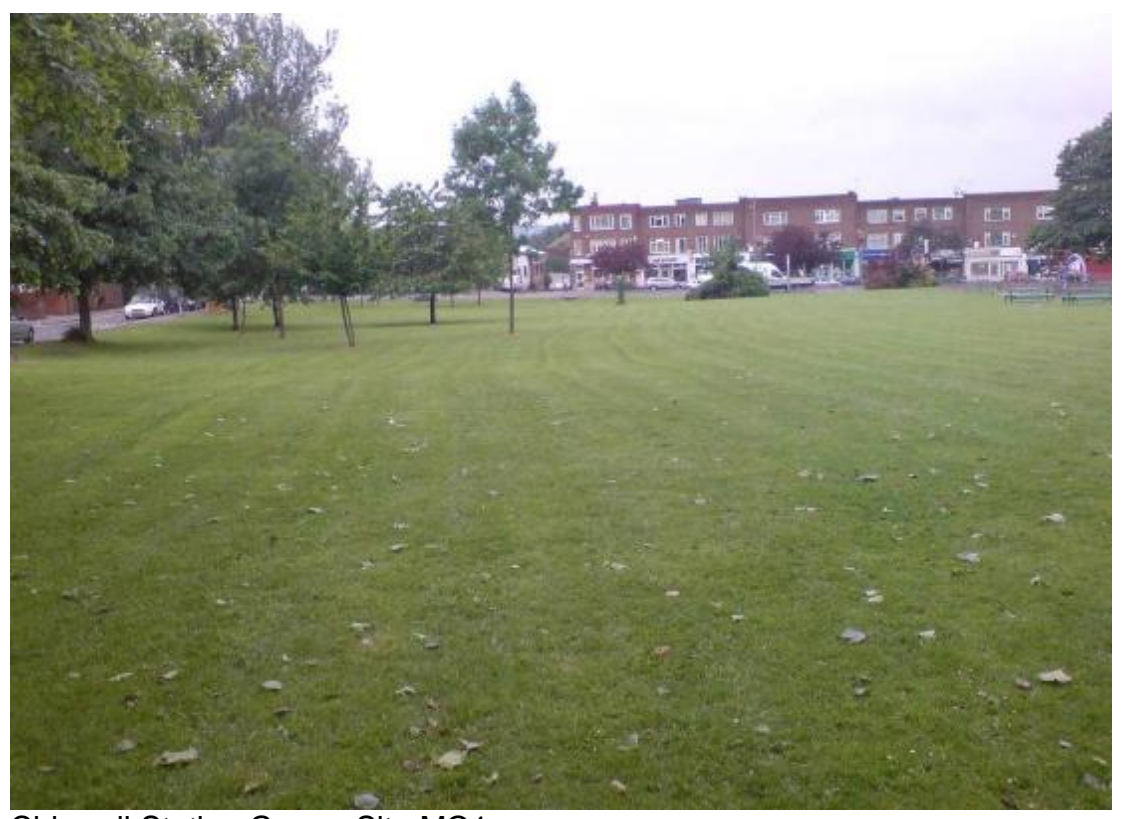
Chigwell Station Green, Site MO1

10.1 Further to the seating and litter bins provided in the playground itself, two picnic tables are provided just to the south of the site, as well as an additional litter bin to the south west. The site has benefitted from the installation of two additional litter bins by the picnic tables, as there is often a significant amount of litter present there. There is a dog waste bin present on the site, although it has been placed on the fencing of the playground. This raises a potential risk of the danger of dogs and young children coming into close contact with each other.