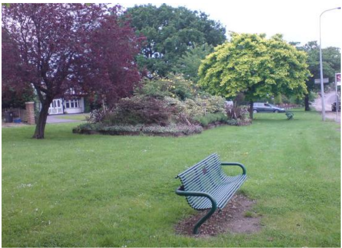
Land east of the junction between Manor Road and Hainault Road, Site MO7

10.7 This is another very attractive piece of amenity green space, and is entirely surrounded by Manor Road. A small car park is located towards the north, for residents who live opposite. The site is largely made up of grass land, with a significant number of large and attractive trees dotted about, as well as a very attractive commemorative garden towards the centre. Two metal benches have been installed towards the south, however no bins have been provided with them. The main issue with this site regards its location, very close to two particularly busy roads. Users must take care to avoid this potential hazard.