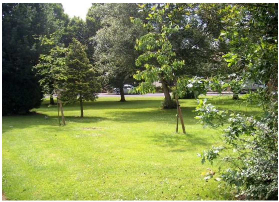
Land Surrounded By Brook Rise, Site MO11

10.15 This is an attractive area of amenity green space, which is clean and tidy, and is clearly very well preserved. It is entirely surrounded by Brook Rise, with houses situated beyond the road. It is predominantly grass land, featuring a significant quantity of medium sized trees and bushes.