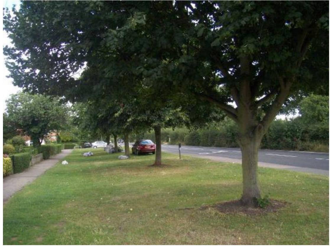
Land to the south east of Elm Close, Site MO2