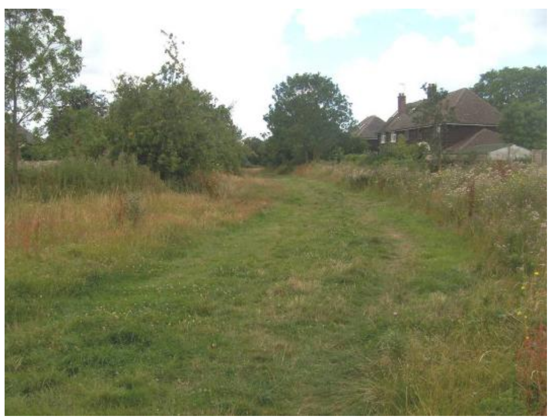
Epping Forest (Long Green), Site SO1