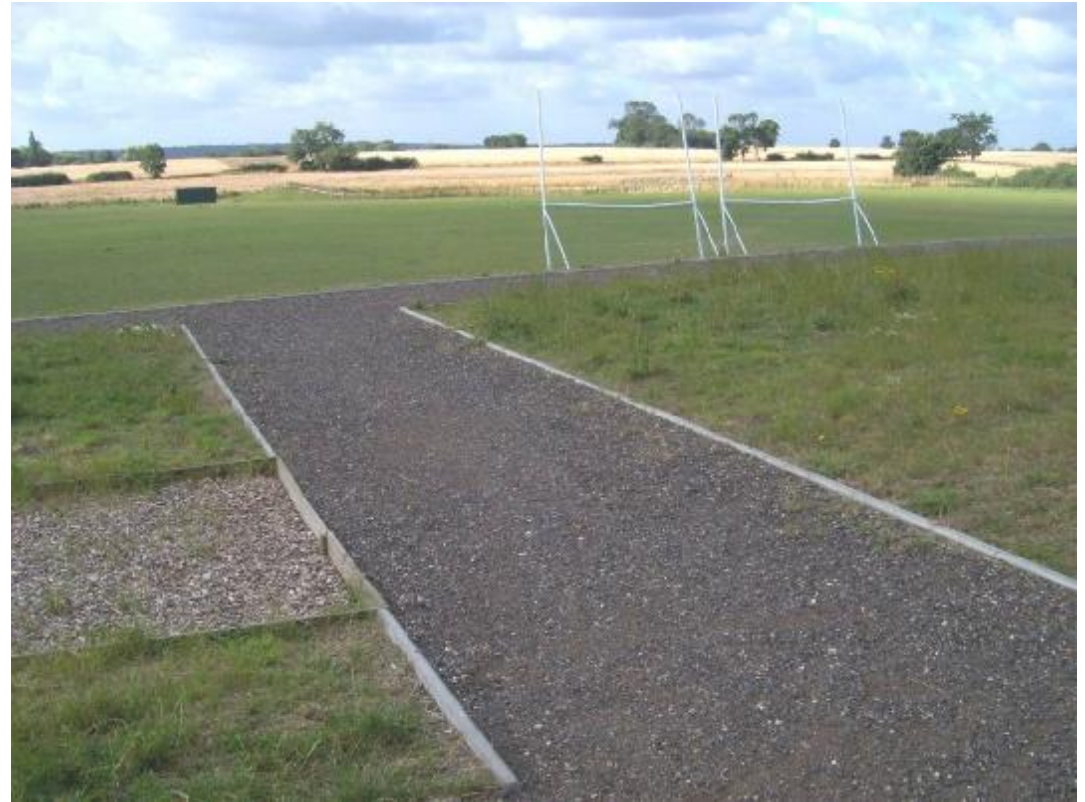
Doorstep Green, Site FP1