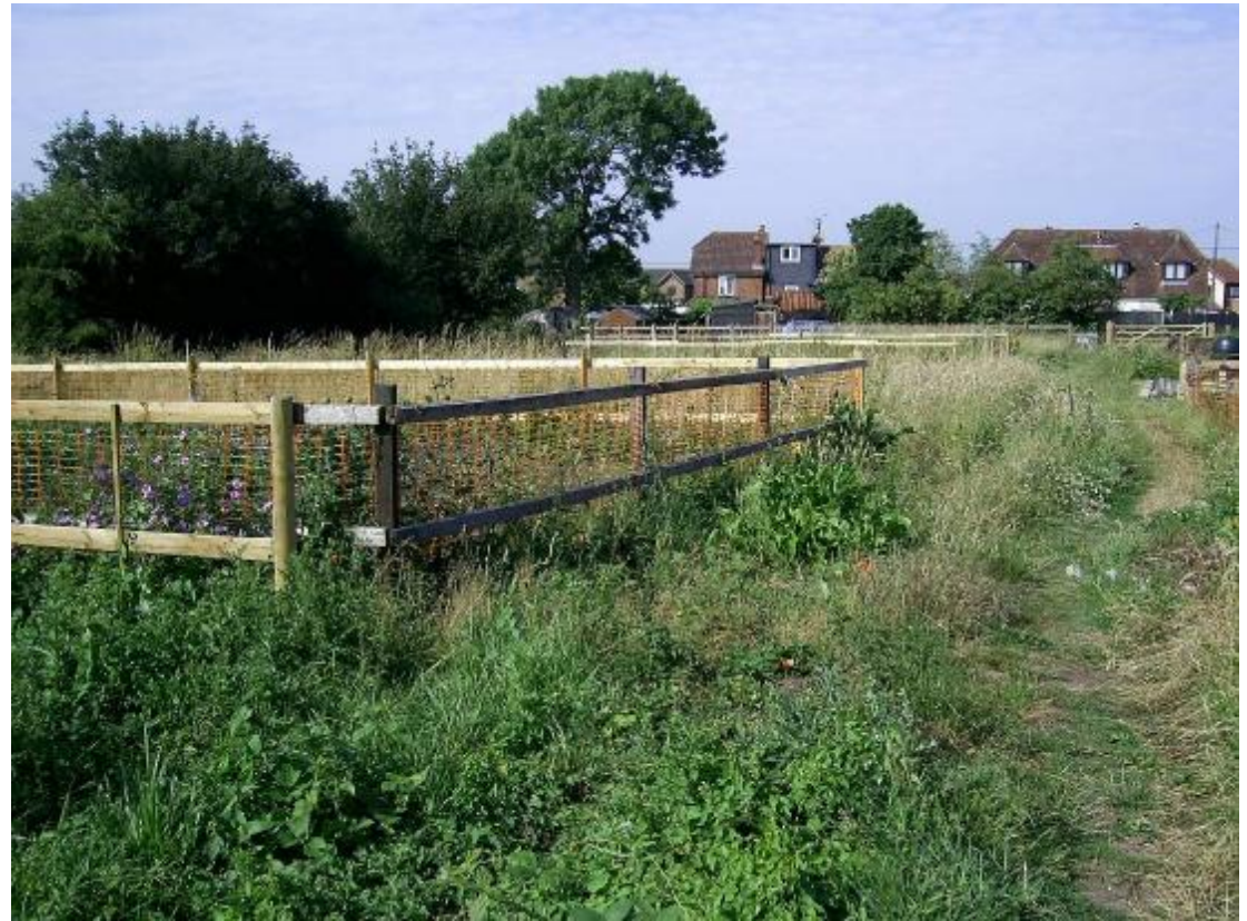
Epping Green Allotment, Site AT1