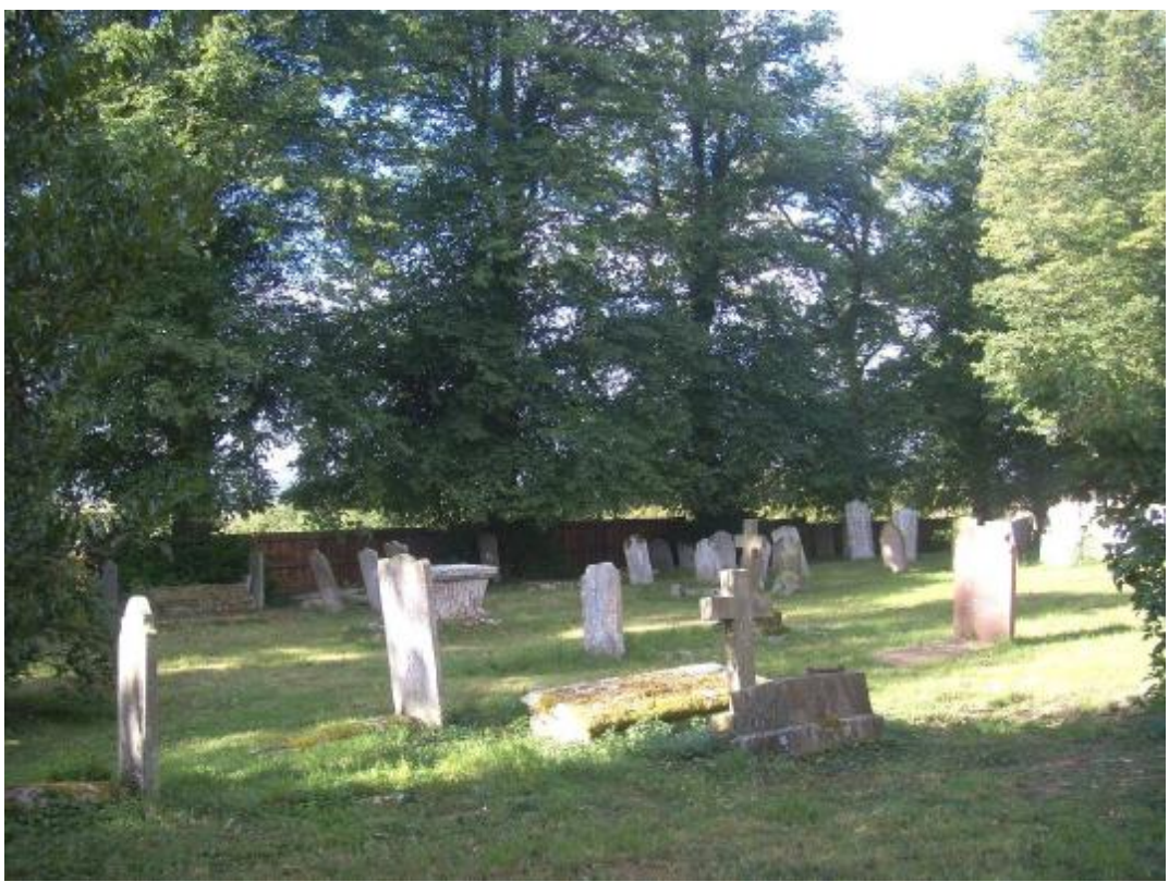
Epping Upland All Saints Church, Site CG1