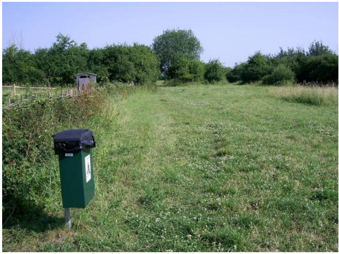
Millennium Garden, Site SO2