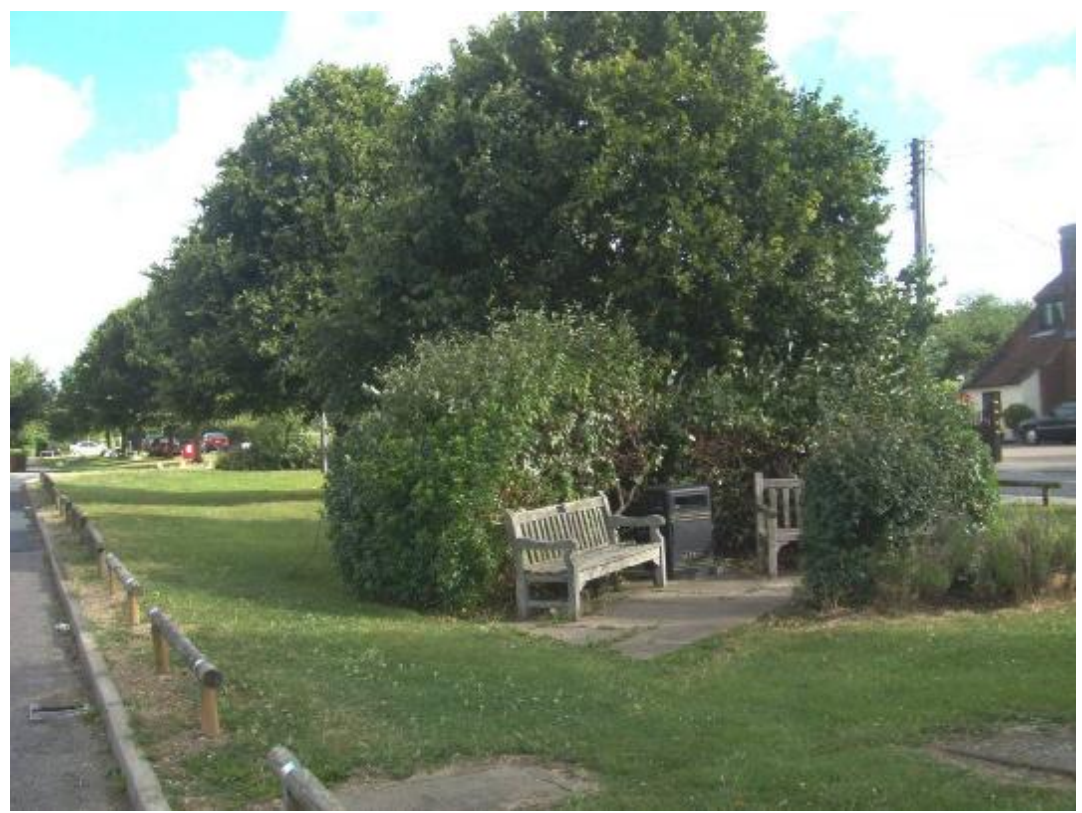
Epping Green Village Green, Site MO1