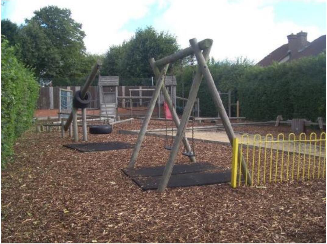
Epping Upland Playground, Site CY1