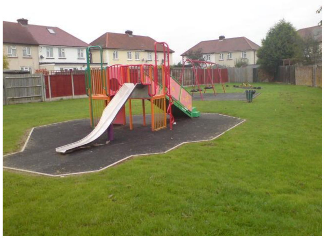
Harold Crescent Playground, Site CY5