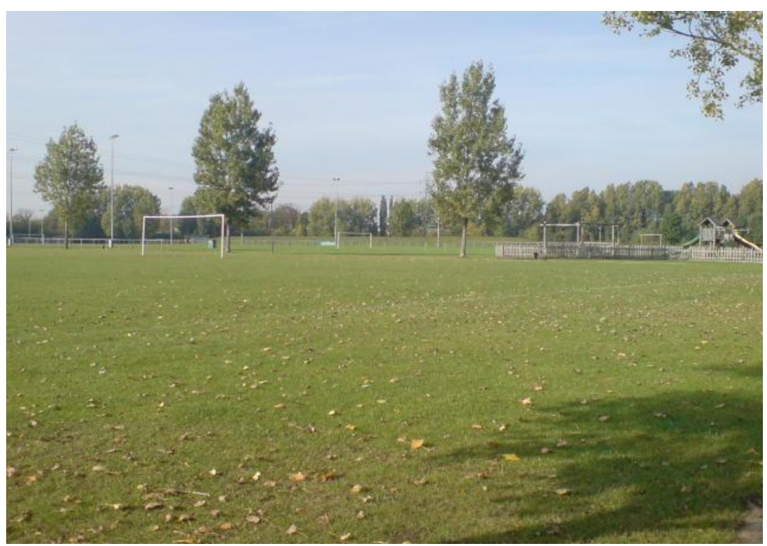
Town Mead Leisure Park, Site FP1