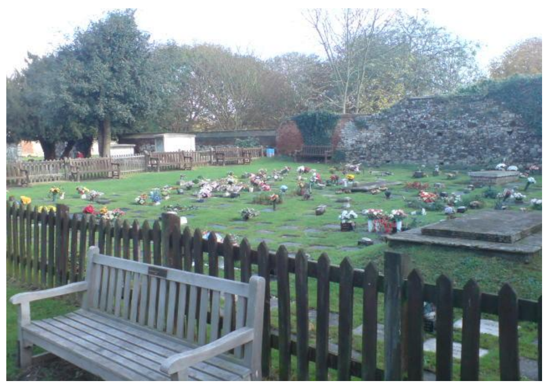
Waltham Abbey Garden Of Rest, Site CG3

to the entrance. These are very slippery when they are wet, and so caution must be taken when standing on these, particularly by those who are less mobile.