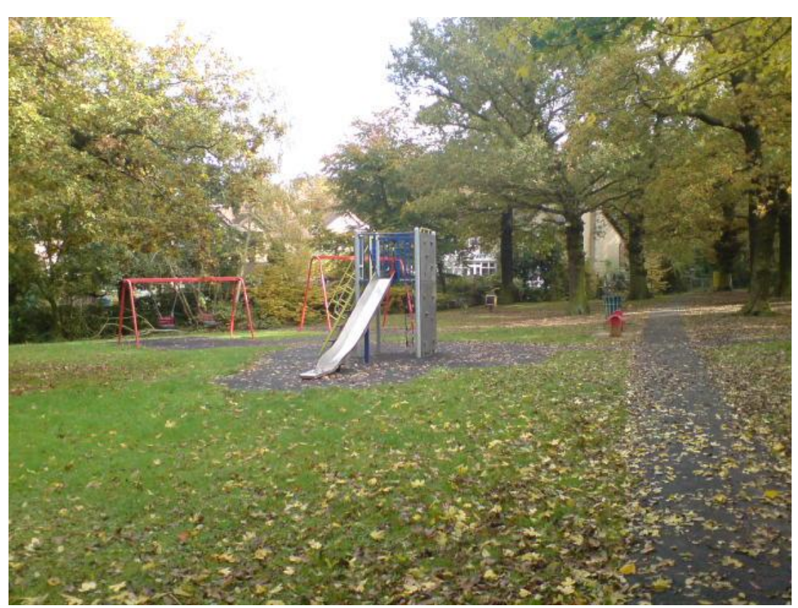
Pynest Green Lane Playground, Site CY6