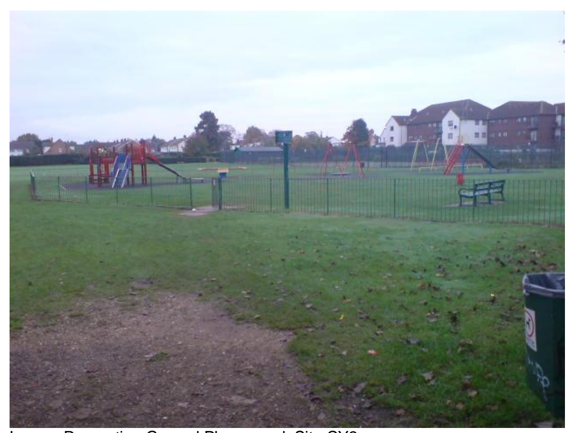
Larsen Recreation Ground Playground, Site CY2

the fact that although the surfaces around the equipment are made of rubber, the rest of the playground is grass, which potentially makes the site more inconvenient to use during the colder and wetter times of the year.