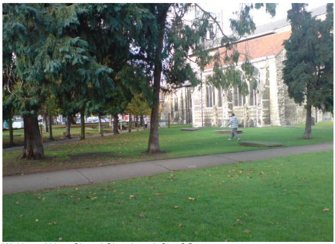
Waltham Abbey Closed Churchyard, Site CG4