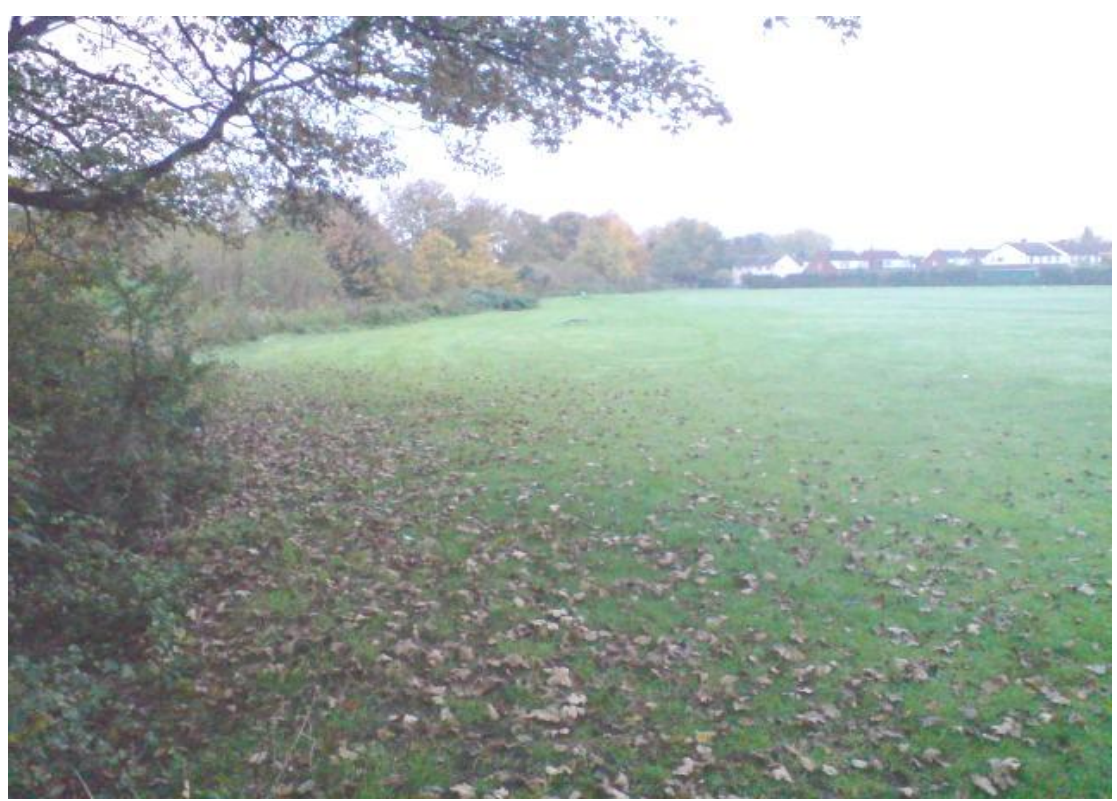
Larsen Recreation Ground, Site FP2

down the eastern perimeter. The football pitches located on the site are particularly close to the brook, and where the pitches and brook are at their closest, there is only a narrow strip of brambles preventing users from falling down the brook's steep verges. Sports equipment could easily be lost to the brook.