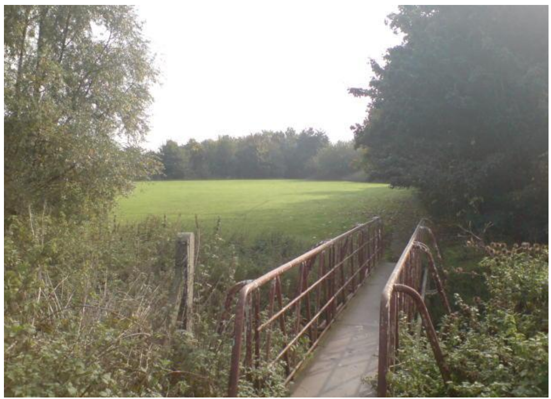
King George V Playing Field, Site FP5

4.9 Located at the end of a small path named Pepper Alley, to the south of Mott Street, this site is privately owned by High Beach Cricket Club and is therefore only accessible when matches are taking place. The site is very pleasant and appears well looked after, whilst its location in the open countryside surrounded on three sides by dense hedgerows and trees gives it a very secluded feel. The site features a single cricket pitch which covers the majority of the site, whilst a cricket pavilion is located in the north west corner.