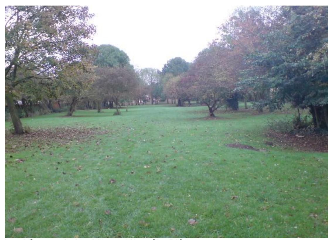
Land Surrounded by Winters Way, Site MO2