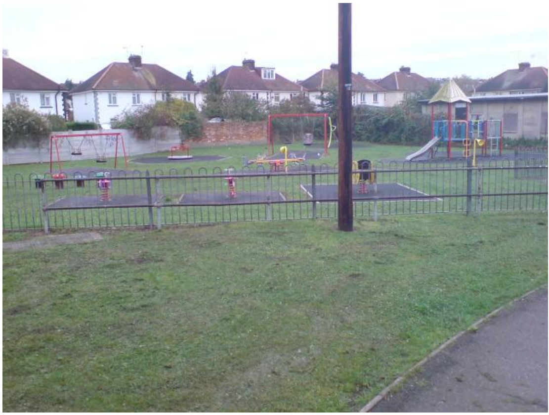
Poplar Shaw Playground, Site CY4