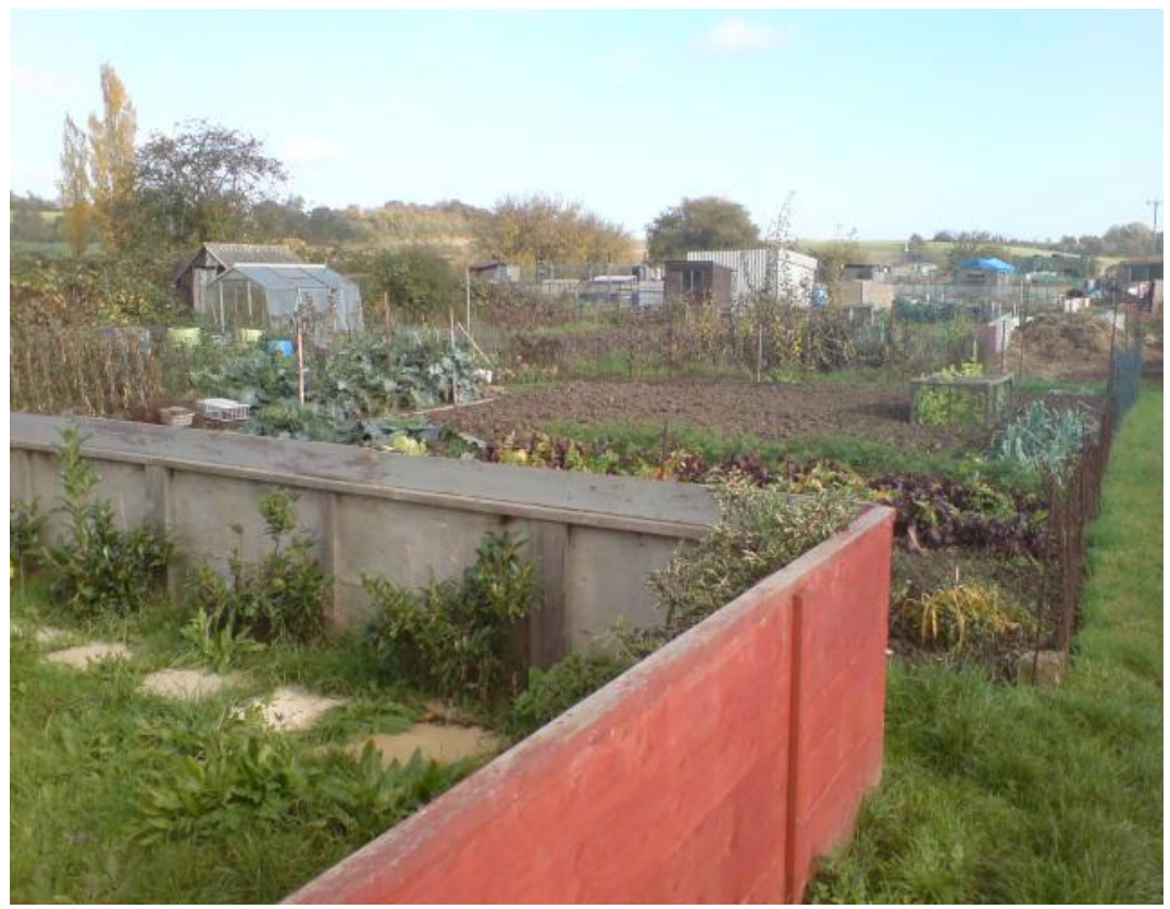
Crooked Mile Allotment, Site AT3