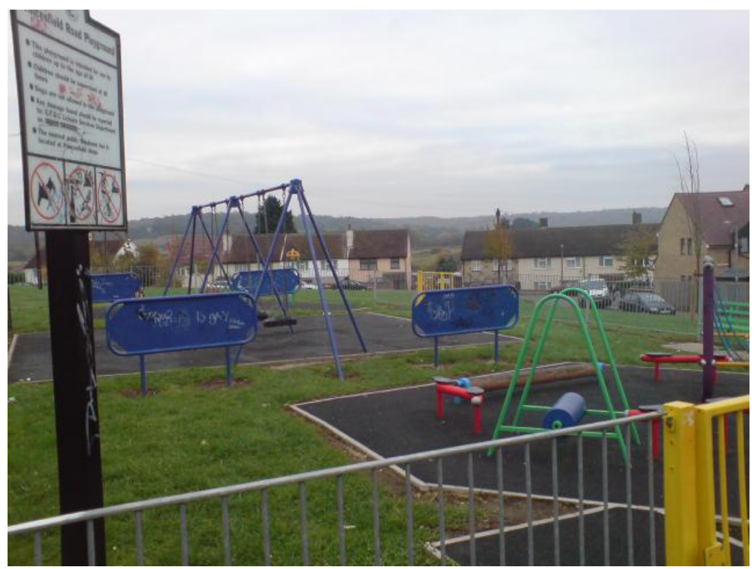
Princesfield Road Playground, Site CY3