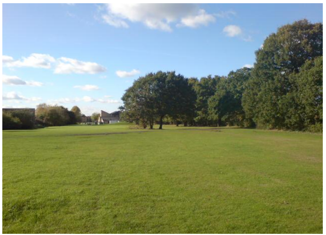
Land to the north of Shernbroke Road, Site MO1

east. Both of these playgrounds have been removed, although evidence of the eastern one is still noticeable, with some of its wood chipping and tarmac surfacing remaining. This is not particularly attractive, and detracts from the overall visual amenity of the site. Another issue is the fact the area is fairly large, it provides no seating, dog waste bins or litter bins. As a result, litter and dog excrement can be seen throughout, but particularly along the banks of the brook.