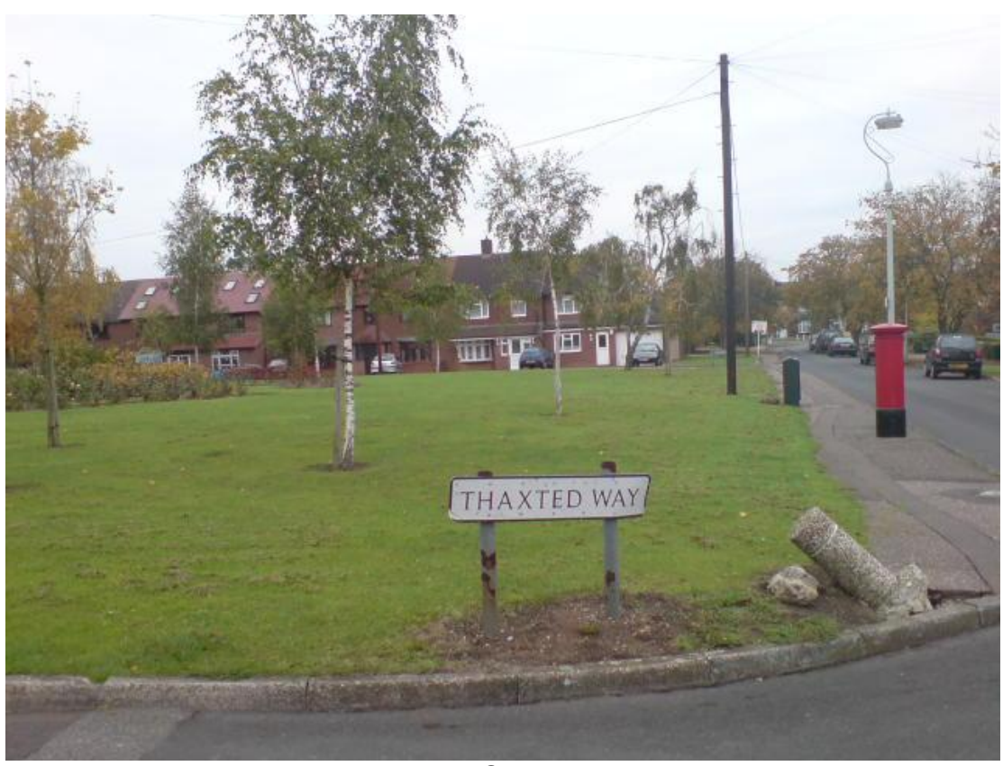
Land surrounded by Thaxted Way, MO4