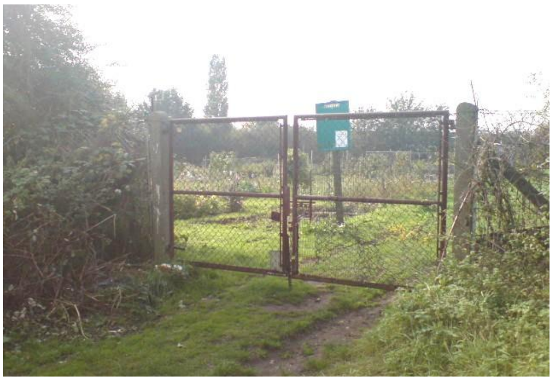
Capershotts Allotment, Site AT2