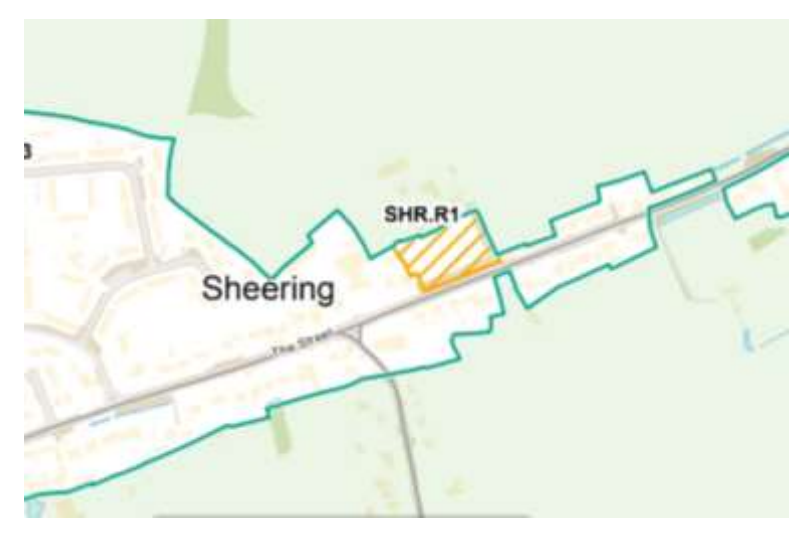
Allocation as Proposed in the Draft Plan

Matter 5 Issue 1 Site Selection Page 4 of 6