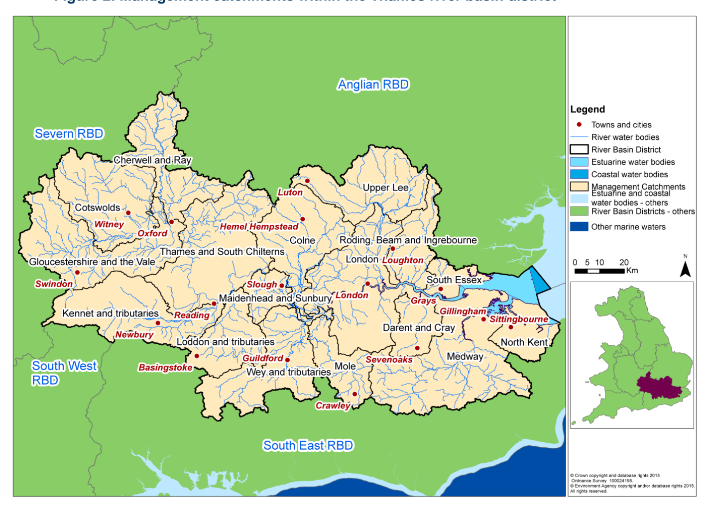
Figure 2: Management catchments within the Thames river basin district

Catchment partnerships are a major initiative to encourage local action to protect and enhance the water environment. The catchment based approach allows flexibility in the geographic scale at which catchment partnerships operate. Most catchment partnerships operate at the water 'management' catchment scale. Some operate at a smaller catchment scale. The partnerships consist of a wide range of stakeholders with an interest in the water environment. This includes, but is not limited to local government, angling interests, wildlife organisations, water companies, land managers, business representatives and government agencies. Figure 2 shows the management catchments in the river basin district.