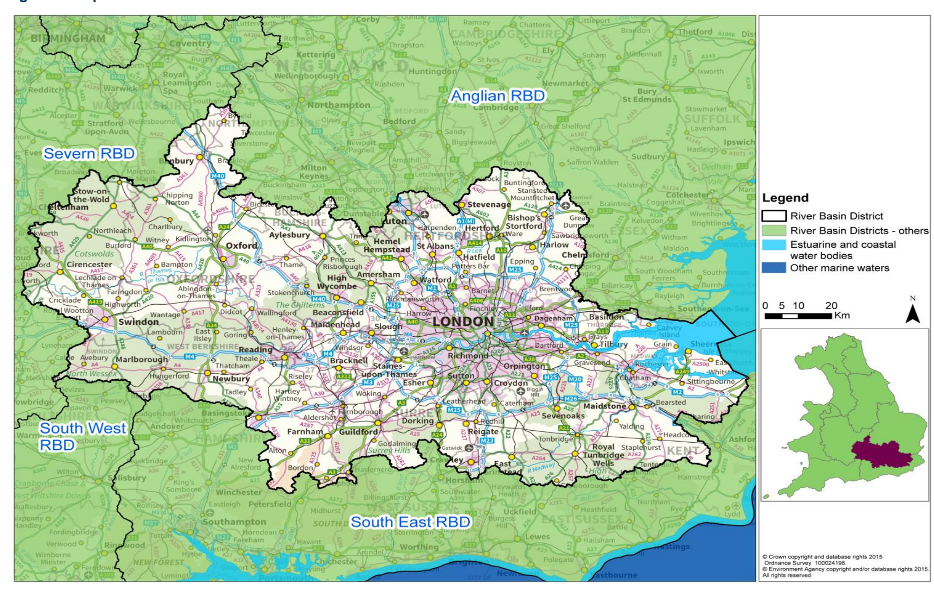
Figure 1: Map of the Thames river basin district