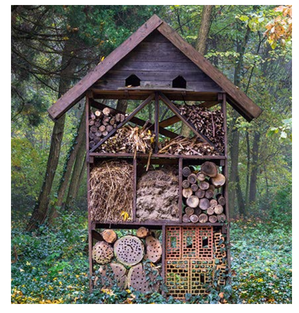
An example of a bug hotel

Typical cost: £9-35 per sqm (depending on planting type and planting density)