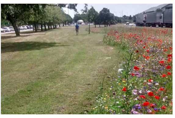
Roadside meadow planting in Leeds