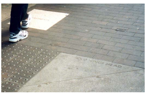
Borough Highstreet by East Architecture