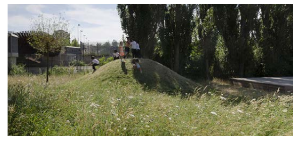
Drapers Field, Waltham Forest by Kinnear Landscape Architects