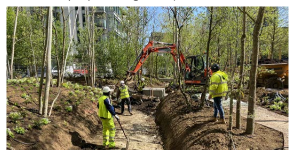
New tree planting in urban 'Forest' by Spacehub

£86-390 (depending on specification of tree and planting density)