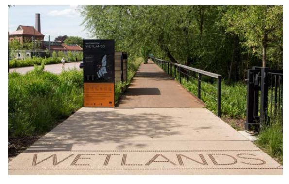
Walthamstow Wetlands by Kinnear Landscape Architects