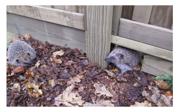
Wildlife-friendly garden fencing