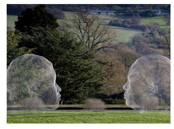
Nuria and Irma, Yorkshire Sculpture Park by Jaume Plensa