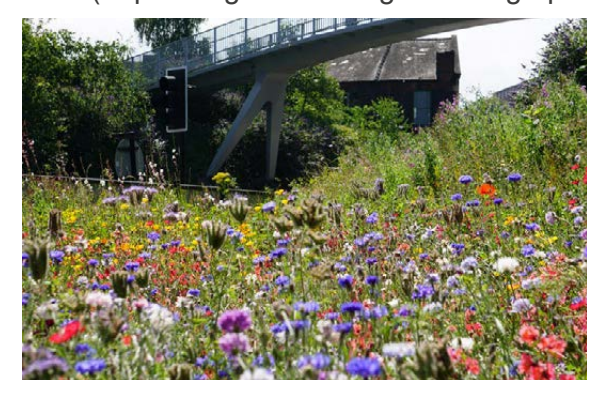
Roadside wildflowers in Sheffield

£2-7 (depending on seeding or turfing options)