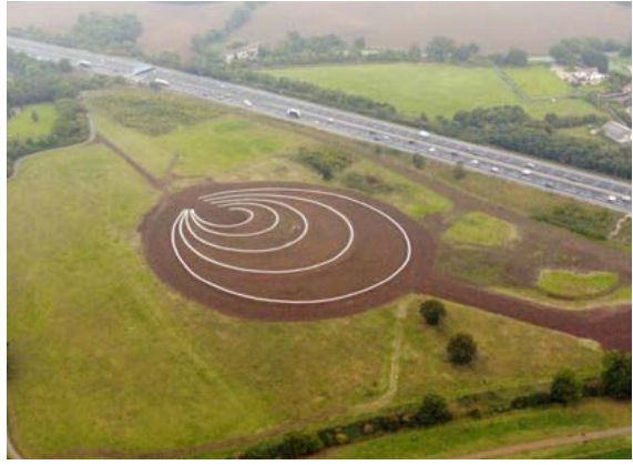
Theydon Bois Earthwork