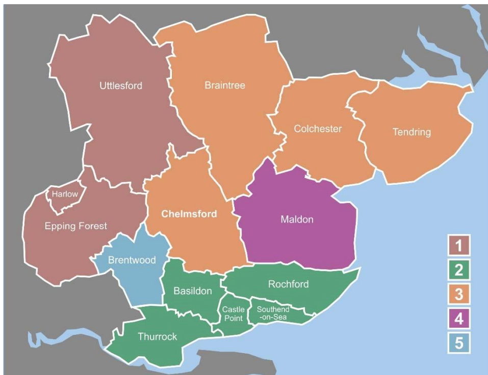
Housing Market Areas in Essex

1.2 The EPOA Policy Forum discussed the matter at its meeting on 6 June and a Task Finish Group with membership from each of the Essex HMAs was established.