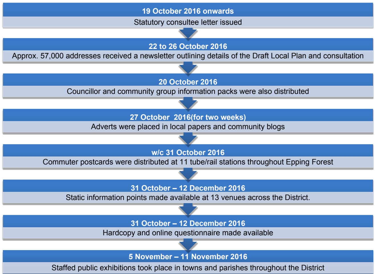
Figure 2 Activities to secure engagement

3.6 The formal six week consultation took place from 31 October – 12 December 2016. In addition to the notification of all those on the database and to ensure widespread awareness of the consultation, the Council arranged for every household in the district to be delivered a newsletter (approximately 57,000 addresses) with details of the Draft Local Plan and consultation events. Where gaps were identified in delivery these were monitored and follow up deliveries were arranged. Adverts were placed in the local newspapers and commuter postcards were distributed at peak hours at 11 tube/rail stations throughout the District. Static exhibitions with copies of questionnaires were available at 12 venues across the District and one in Harlow: